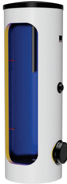
OKCE 500 S, 750 S, 1000 S